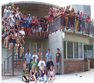
Band Camp Alamosa, CO July 2007

regular basis that helps you stay “tied-together” with what’s going on in the MCHS music program.