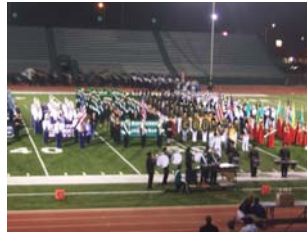
Awards Ceremony 2007 State Competition GJ, CO

Thanks to everyone who helped with the Silent